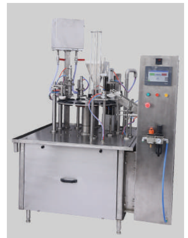
AUTOMATIC ICE CREAM CONE & CUP FILLING MACHINE