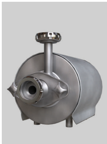
MILK TRANSFER PUMP